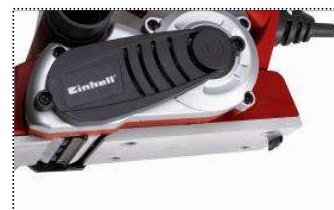
Aluminium planer plate with automatic stoppage clip to protect the knife and surface