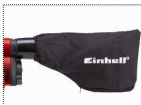
Chip throw-off optional left/ right