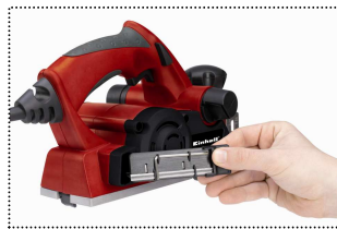
Knife and tool depot